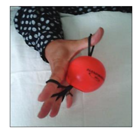
Figure 1: Hand exercise with ball

During the exercise, the patients squeezed the ball for 1 s (Step 2) and then opened their fingers (Step 3). The exercise was performed actively for 30 seconds to 1 min, and patients were instructed to continue with the exercise program at home two times/day for a 3-month period. Exercise steps are shown in Flowchart 2. An educational brochure about exercise was given to patients, and they were informed to stop performing the exercises if they felt pain or fatigue. Patients recorded the time they performed the exercises every day on the monthly follow-up schedule. This schedule was given to them at the beginning of the treatment, and they received instructions for filling out the schedule.