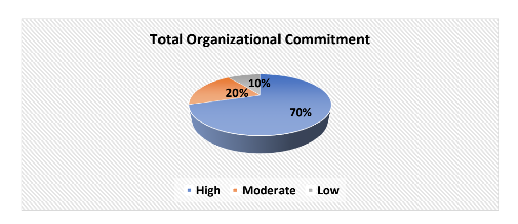
Figure (2) Total organizational commitment as perceived by staff nurses (n=120)