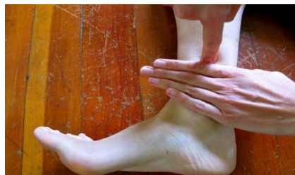
Figure (1): Sanyinjiao Point

Within the beginning of active phase(4cm dilatation) this intervention was applied through 30 minutes . The control group received the routine care of the hospital.