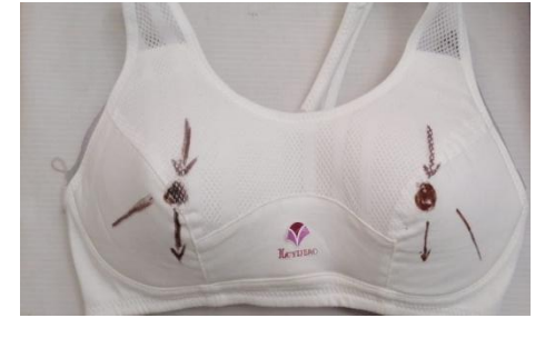
(Figure 3) supportive bra

• The researcher offered each woman with equipment to help them perform the technique, which included a Gua Sha device (figure 2) and a supportive bra based on breast size (small-medium-large) that was drawn in a direction to facilitate the technique application (figure 3).