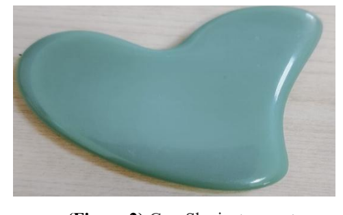
(Figure 2) Gua-Sha instrument

https://www.myungtherapies.com/wpcontent/uploads/2012/03/Effects_of_Gua_Sha_Therapy_on_Breast_Engorgement_.31.pdf