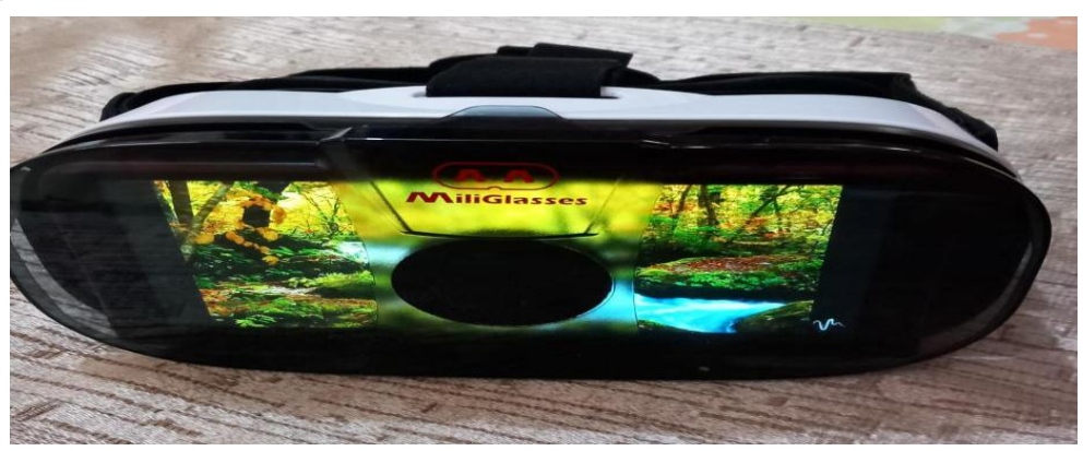
Figure (1) Virtual reality headset