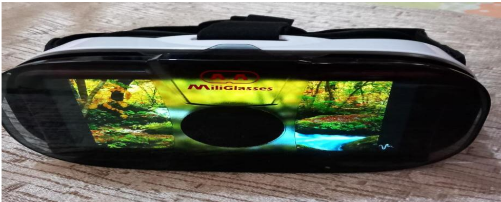
Figure (1) Virtual reality headset

- Finally, A comparison was performed between the two groups to ascertain the effect of immersive virtual reality on labor pain intensity, duration of the first stage, anxiety, and satisfaction levels among primigravidae.