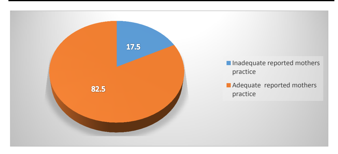
Figure (2): Percentage distribution of total mothers practice level regarding avoiding parasitic infection (n= 200).

Table (3): Relation between demographic characteristics of studied mothers and their knowledge