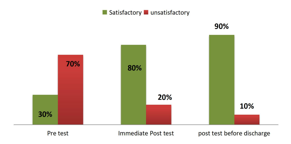
Table (4) Comparison between Total Mean Score of Mothers' Knowledge in the pretest and posttest regarding colostomy and its care (n=60).